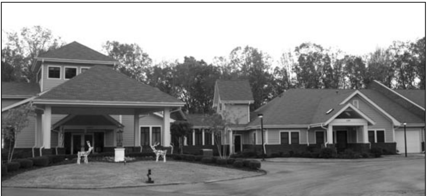
Villa Vianney, home for retired priests of the Diocese of Memphis.